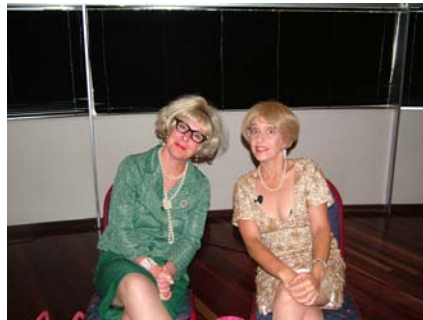
The Signoras, performed at the Seminar

This event was a joint initiative with Darebin Ethnic Communities Council and featured the launch of Darebin eForum; an online discussion group. The first topic for discussion is on Community Harmony. The discussion will be on line till end of May and participants can win prizes. For further information on the Darebin eForum and to register and join the discussion, you can visit the eForum site at: http://eforum.darebin.vic.gov.au and join the Community Harmony discussion group.