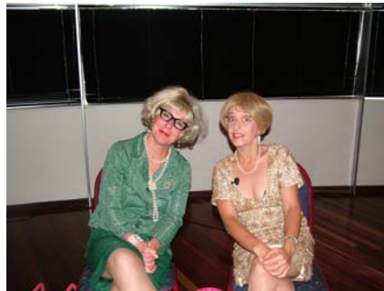
The Signoras, performed at the Seminar

This event was a joint initiative with Darebin Ethnic Communities Council and featured the launch of Darebin eForum; an online discussion group. The first topic for discussion is on Community Harmony. The discussion will be on line till end of May and participants can win prizes. For further information on the Darebin eForum and to register and join the discussion, you can visit the eForum site at: http://eforum.darebin.vic.gov.au and join the Community Harmony discussion group.